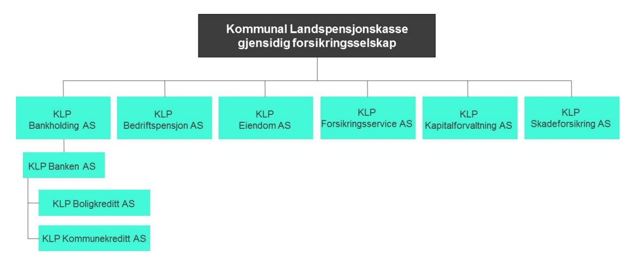
Figure 1: Corporate structure

Mutual funs investments where the KLP Group has control over the investments such that there is a consolidation requirement under the rules in IFRS, are consolidated in. The minority interest is classified as a liability.