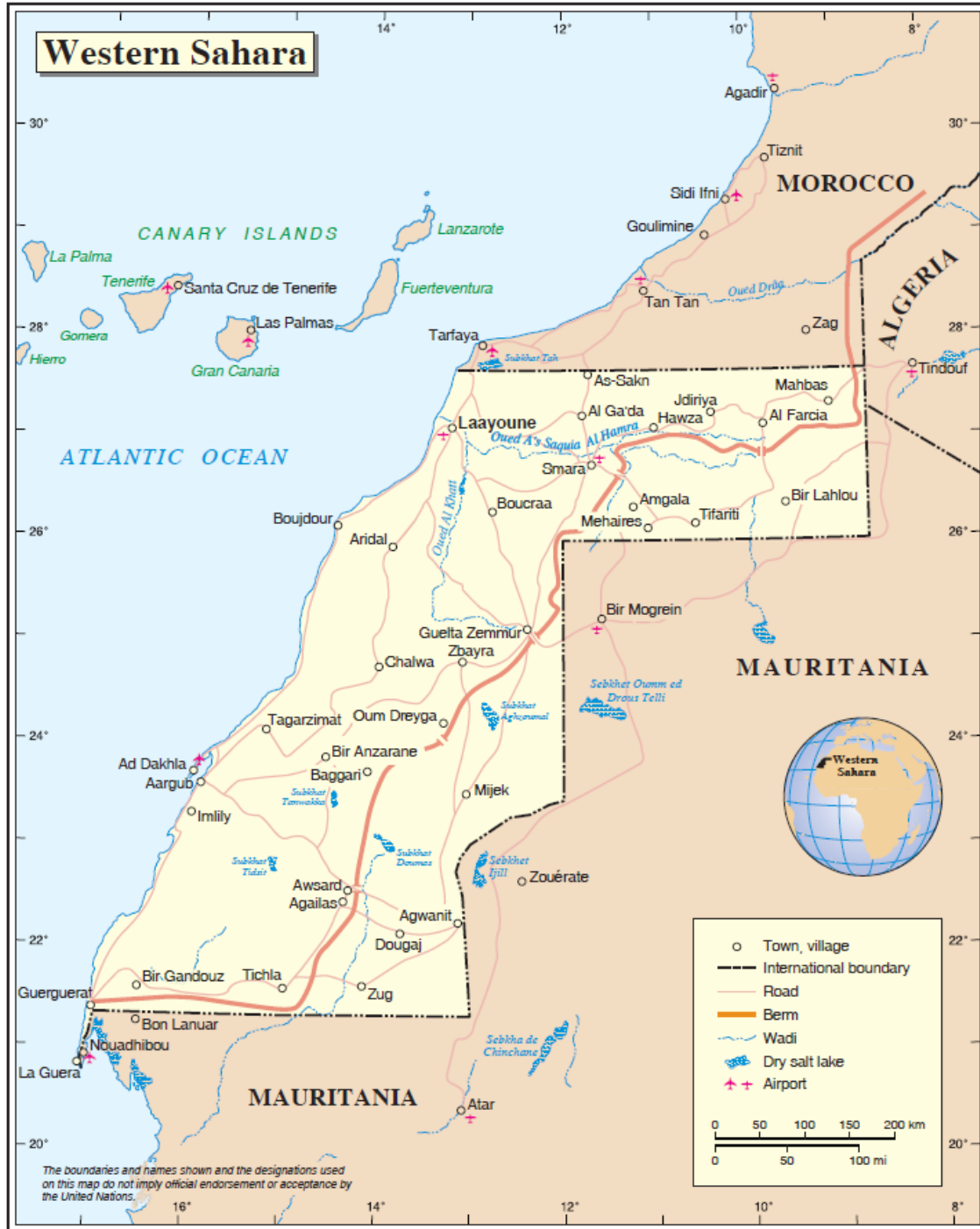
Map No. 3175 Rev. 4 UNITED NATIONS October 2012